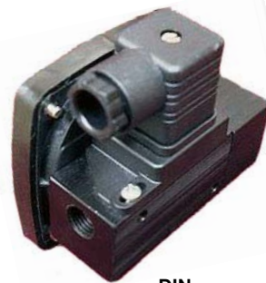
DIN Connector Shown

**Product of the switching voltage & current shall not exceed 60W