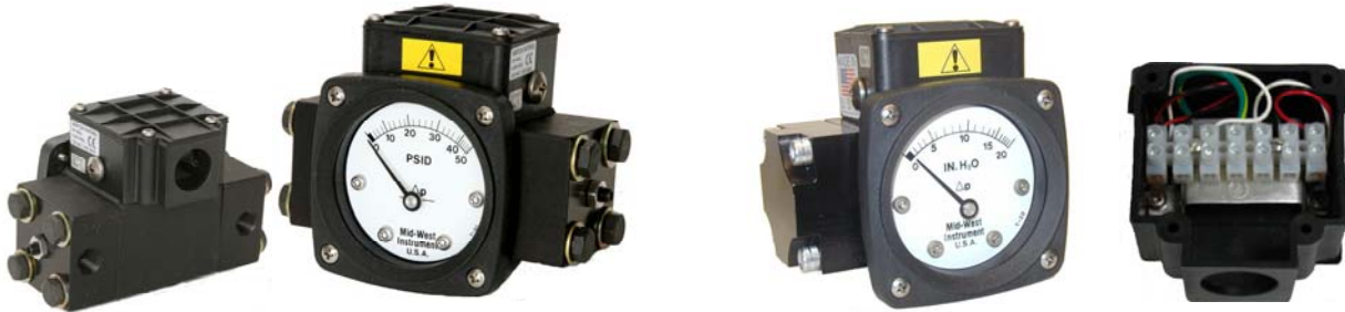
Model 140 shown with “AA” switch option

(1) Reed switch located inside NEMA 4x enclosure with 7 position terminal strip. An opening at rear of enclosure accepts ½” flexible weather-proof or conduit connector (supplied by customer).