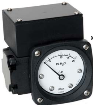
Model 142 with 2-1/2" Dial & 4-20mA Transmitter

“A World Leader in Differential Pressure Gauges, Switches & Transmitters