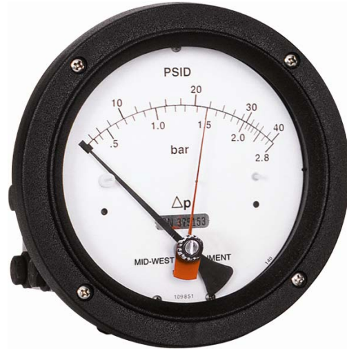
Model 140 0-40 PSID & 0-2.8 Bar with 4-1/2" Dial & maximum follower pointer