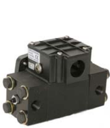
Model 140 shown with “AA” switch option

(1) Reed switch located inside NEMA 4x enclosure with 7 position terminal strip. An opening at rear of enclosure accepts ½” flexible weather-proof or conduit connector (supplied by customer).