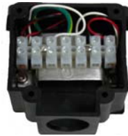
Model 142 shown with “BA” switch option

(2) Reed switches located inside NEMA 4x enclosure with 7 position terminal strip. An opening at rear of enclosure accepts ½” flexible weather-proof or conduit connector (supplied by customer).