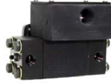
Model 140 shown with “EA” switch option.

(1) Reed switch in general purpose enclosure Division 2 Hazardous locations with 7 position terminal strip. An opening at rear of enclosure accepts ½” flexible weather-proof or conduit connector (supplied by customer).