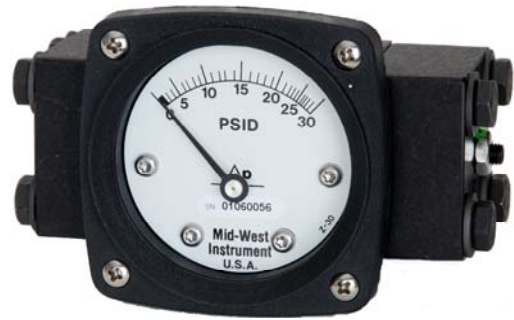
Model 140 0-30 PSID with 2-1/2" Dial

“A World Leader in Differential Pressure Gauges, Switches & Transmitters