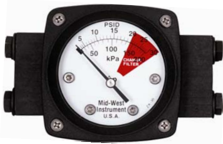
Model 140 0-30 PSID & 0-200 kPa with 2-1/2" Dial & Special Color Dial