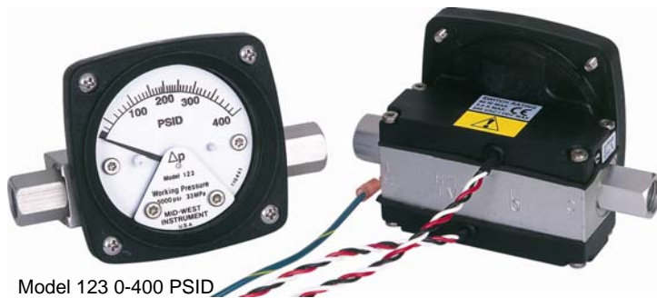
Model 123 0-400 PSID Shown with 2 Std. Switches

Due to precision sizing of piston and body bore, leakage across piston will not exceed 15 SCFH air at 100 PSID at ambient temperature.