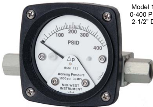
Model 123 0-400 PSID 2-1/2" Dial

A low cost differential pressure gauge for use in measuring the pressure drop across filters, strainers, separators, valves, pumps, chillers, etc., and for local flow indication and control.