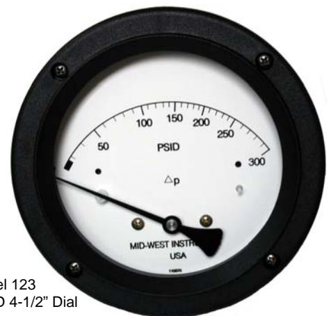
Model 123 0-300 PSID 4-1/2" Dial

An optional maximum indication follower pointer provides automatic indication of maximum differential occurring during a time period or system cycle. Reversed pressure ports are optionally available to facilitate installation and readability depending on which side of a filter, etc., the instrument must be installed.