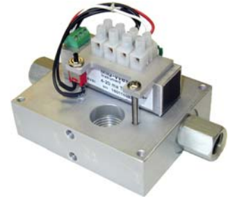
Open view Model 121 Transmitter 4-20 mA terminal strip w/ 1/4" FNPT end connections

Piston-Type Differential Pressure Gauges are available with one or two hermetically sealed reed switches. The switches are adjustable within a defined percentage of the full scale range of the gauge and are available in SPDT and SPST, normally open or normally closed configurations for various load/power ratings. The switches can be set to activate or deactivate on rising or falling pressure. Switches are "CE" marked per the EU low voltage directive. Models 121 can be configured for use in Hazardous Locations.