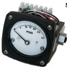
Model 121 Switch ¼" FNPT back connections