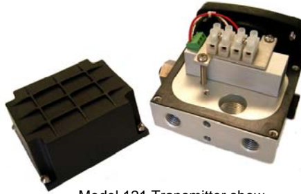
Model 121 Transmitter show with NEMA 4X plastic cover